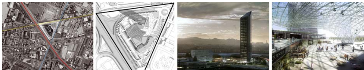
Figure1. Concept developed by the architectural office.